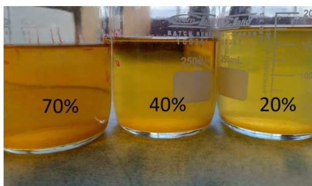
Figure 1. Colors of obtained macerates.

TSS: Total soluble solids; FW: Fresh weight; The a,b,c mean in columns followed by the same letters are not significantly different at P=0.05.