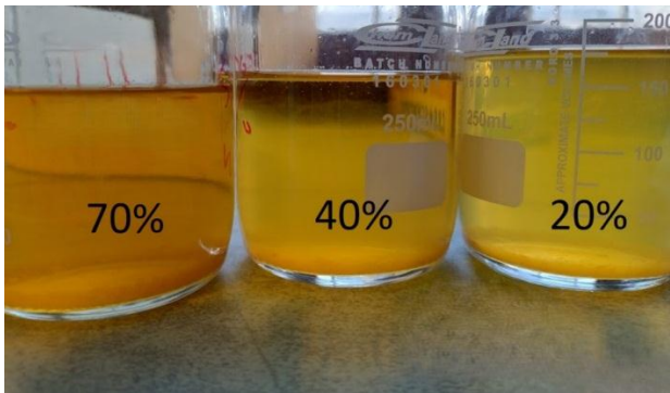
Figure 1. Colors of obtained macerates.

TSS: Total soluble solids; FW: Fresh wieght; The a,b,c mean in columns followed by the same letters are not significantly different at P=0.05.