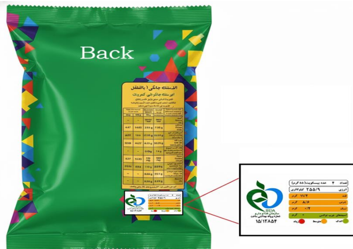
Figure 2. Back-of-package nutrition labeling in Iran.

quality. This score is derived from a calculation that weighs beneficial components (like fiber, protein, and fruit/vegetable content) against detrimental components (like energy, sugar, saturated fats, and salt) per 100 grams or milliliters, thereby resolving complex nutrient trade-offs into a single, easily digestible grade (Julia et al. , 2018). The most vulnerable group to NCDs are individuals with low education, income, or social class; thus, the implementation of a simpler directive food labeling such as Nutri-Score which indicates the overall healthiness of a food, or a combined system such as the health star rating used in Australia, may be a better option rather than the TLL, especially for people with lower educational backgrounds (Di Cesare et al. , 2013, Niessen et al. , 2018). Notably, in a recent study by Pettigrew et al. , which analyzed the effectiveness of five FOP nutrition labels across 18 countries, they found Nutri-Score performed best in terms of both attraction and aversion results for understanding and simulated choice outcomes (Pettigrew et al. , 2023).