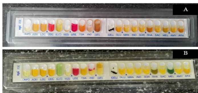
Figure 1. A) Yersinia intermedia and B) Yersinia enterocolitica biochemical test results.

a direct relationship between the severity of contamination and the type of Olivier salad in terms of traditional or industrial preparation methods, which ultimately affects the product's acceptability.