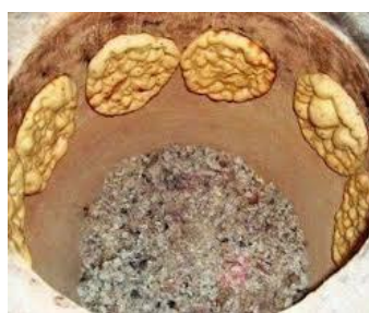
Nan- Tanuri (Taftoon)